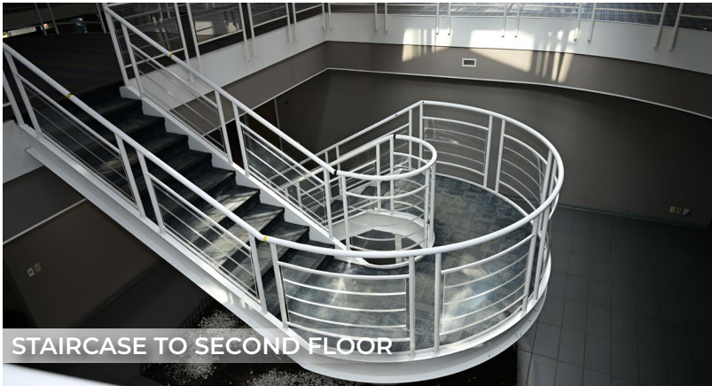
STAIRCASE TO SECOND FLOOR