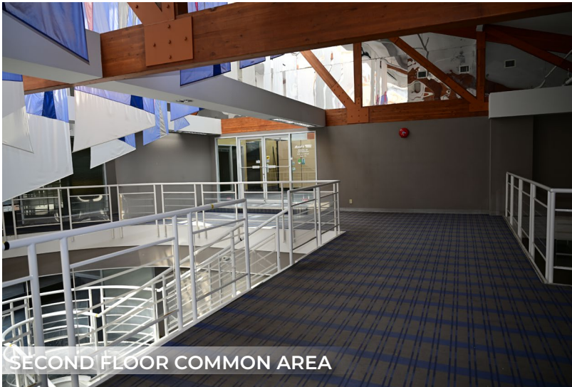
SECOND FLOOR COMMON AREA