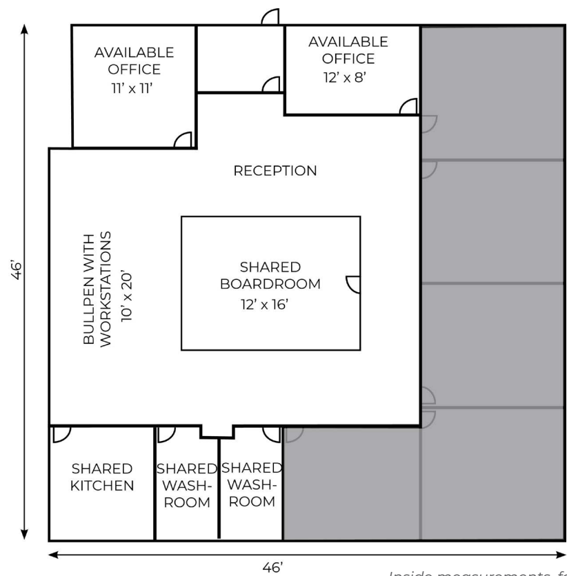
Inside measurements, for illustration purposes only