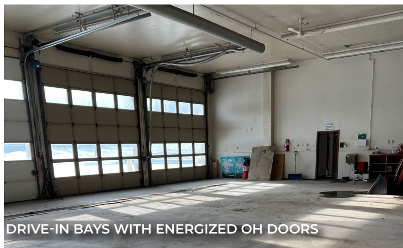
DRIVE-IN BAYS WITH ENERGIZED OH DOORS