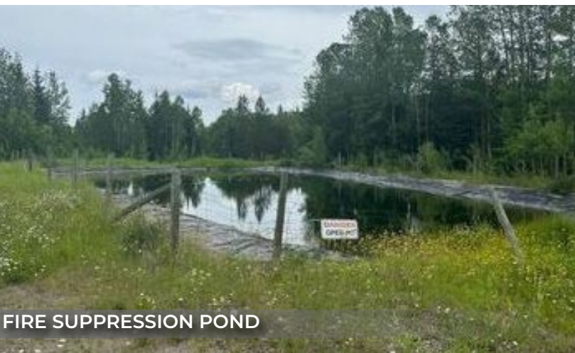
FIRE SUPPRESSION POND