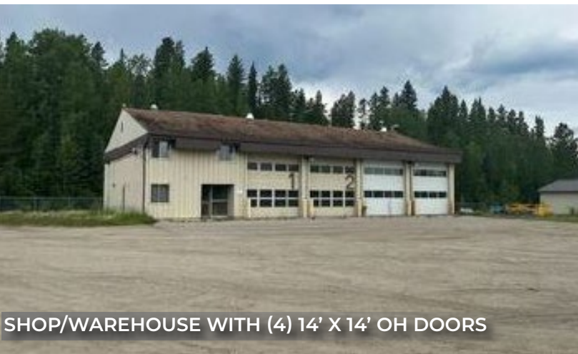
SHOP/WAREHOUSE WITH (4) 14' X 14' OH DOORS

For Sale | Three Stand Alone Buildings on 12.65 Acres \pm , Yellowhead County, AB