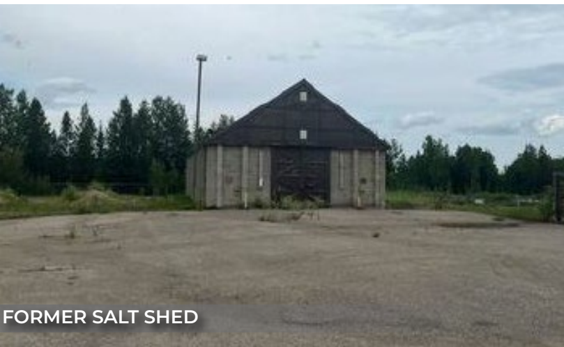
FORMER SALT SHED

For Sale | Three Stand Alone Buildings on 12.65 Acres \pm , Yellowhead County, AB