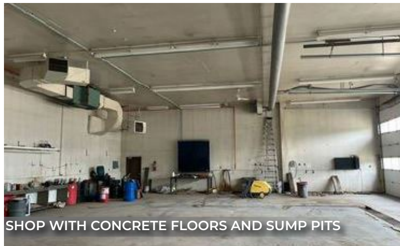
SHOP WITH CONCRETE FLOORS AND SUMP PITS