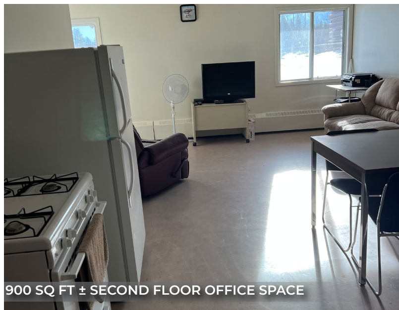
900 SQ FT \pm SECOND FLOOR OFFICE SPACE