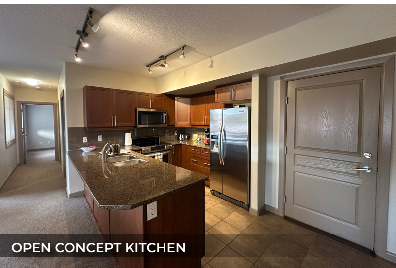
OPEN CONCEPT KITCHEN