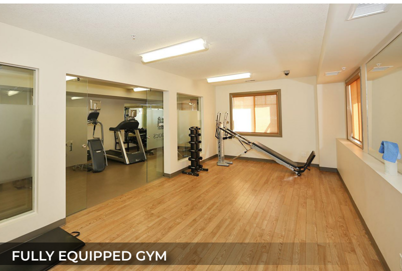
FULLY EQUIPPED GYM